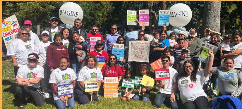
2023 IMAGINE End Child Poverty CA Rally in Sacramento

Since they went away, child poverty has skyrocketed.