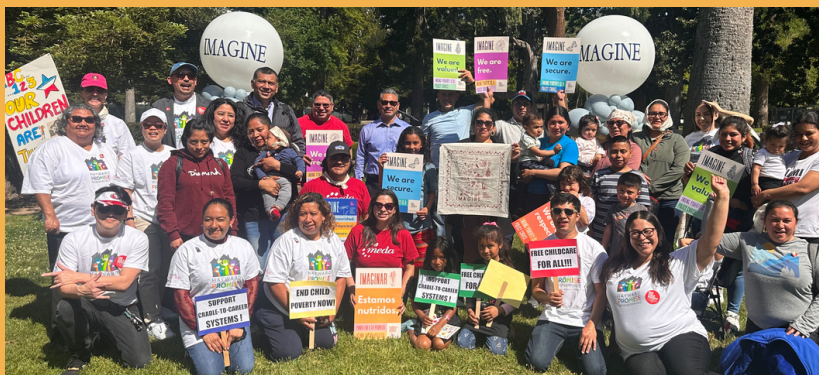
2023 IMAGINE End Child Poverty CA Rally in Sacramento

Since they went away, child poverty has skyrocketed.