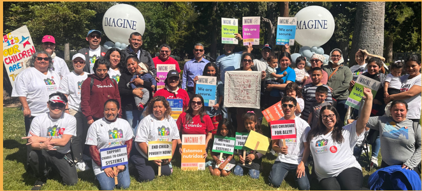
2023 IMAGINE End Child Poverty CA Rally in Sacramento

Since they went away, child poverty has skyrocketed.