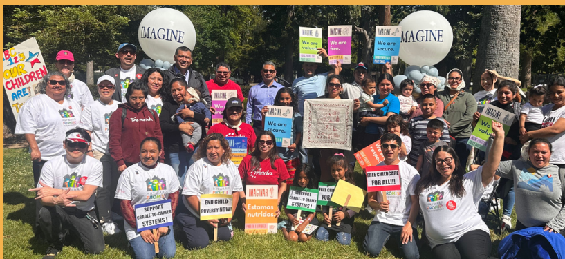
2023 IMAGINE End Child Poverty CA Rally in Sacramento

Since they went away, child poverty has skyrocketed.