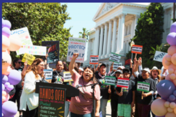
2024 IMAGINE End Child Poverty CA Rally in Sacramento

California has made major progress. State and federal governments have proven their ability to lift children and families out of poverty and into lives where they feel valued, secure, and free. During the pandemic, federal and state governments successfully cut poverty in half with the rollout of the Expanded Child Tax Credit, SNAP/CalFresh emergency allotments, and Pandemic EBT . When pandemic programs went away, California fought hard to fill the gap.