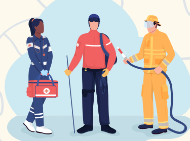
Parents are able to attend work or school