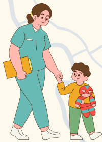
Parents choose the care type that meets their needs

APPs have evolved to offer additional services that will help families achieve economic self-sufficiency, including: food access, housing, medical care, mental health, home-visiting, transportation, legal assistance, translation services, and more.