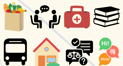
The family accesses supportive services that meet their needs