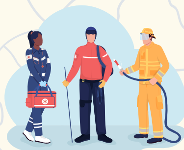
Parents are able to attend work or school