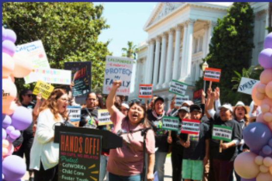
2024 IMAGINE End Child Poverty CA Rally in Sacramento

California has made major progress. State and federal governments have proven their ability to lift children and families out of poverty and into lives where they feel valued, secure, and free. During the pandemic, federal and state governments successfully cut poverty in half with the rollout of the Expanded Child Tax Credit, SNAP/CalFresh emergency allotments, and Pandemic EBT . When pandemic programs went away, California fought hard to fill the gap.