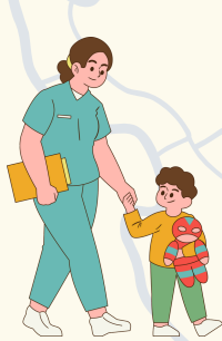
Parents choose the care type that meets their needs

APPs have evolved to offer additional services that will help families achieve economic self-sufficiency, including: food access, housing, medical care, mental health, home-visiting, transportation, legal assistance, translation services, and more.